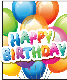
Serena Hantoush Nov 7